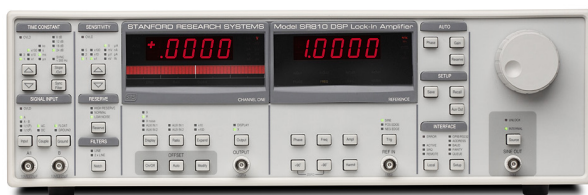
SR810 DSP Single Phase Lock-In Amplifier