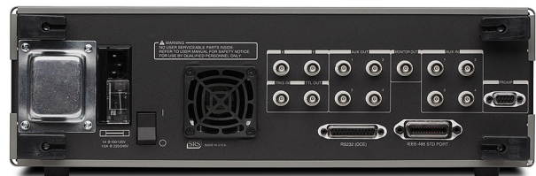
SR810/830 rear panel